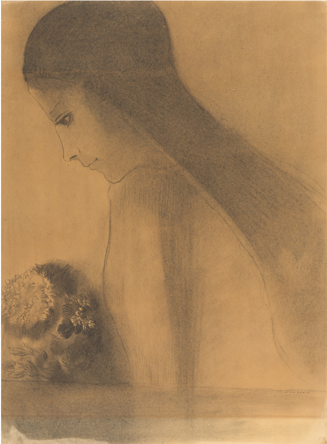
Cat. 9 Odilon Redon, Woman Looking at Flowers