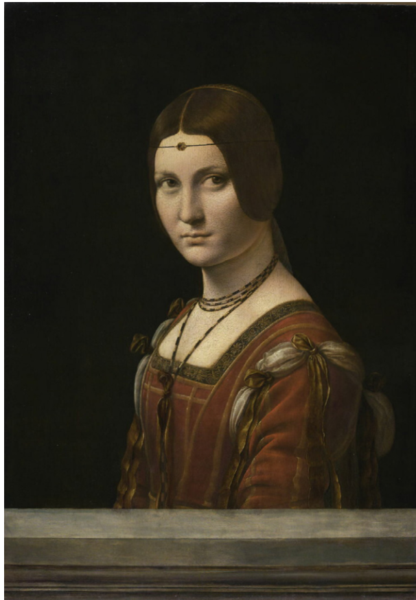
Fig. 4j Leonardo da Vinci, La Belle Ferronnière , 1490–97. Oil on panel, 63 × 45 cm. Musée du Louvre, Paris