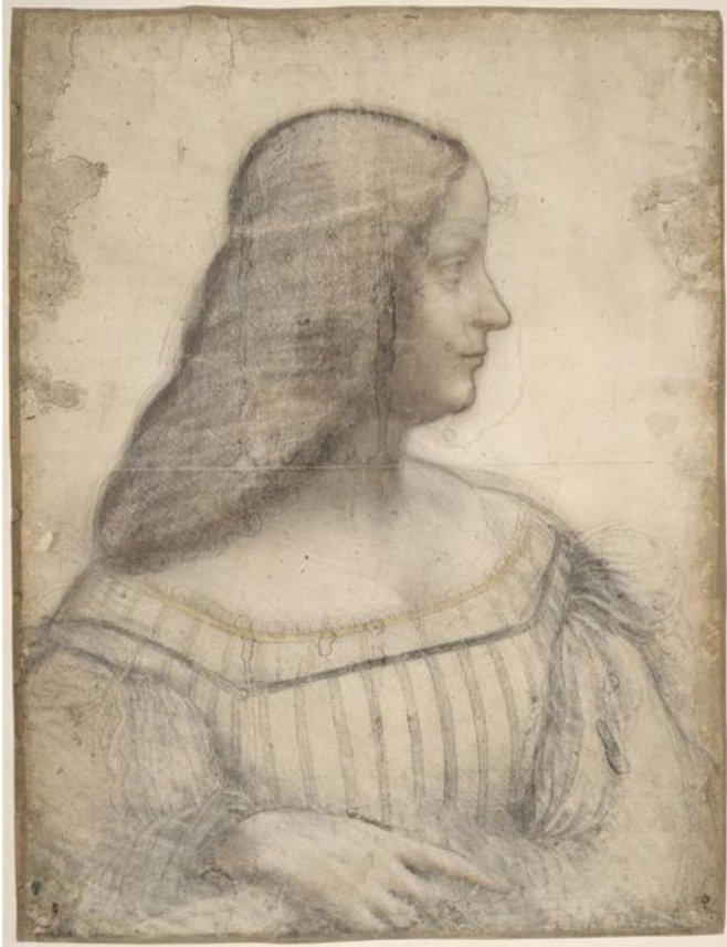
Fig. 4g Leonardo da Vinci. Portrait of Isabelle d'Este , 1499–1500. Red and black chalk and stumping, ochre chalk, white highlights on paper, 61 × 46.5 cm. Musée du Louvre, Paris