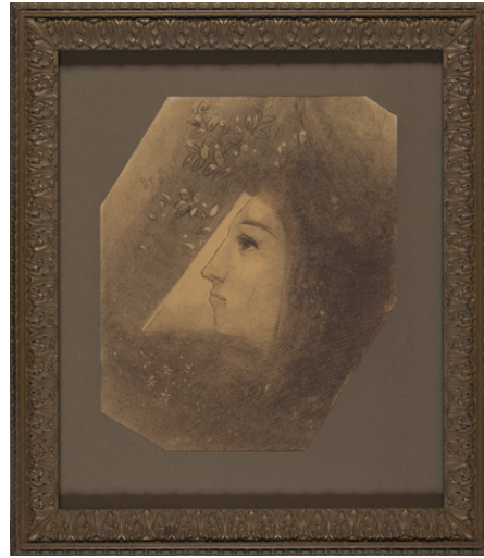
Fig. 4c Cat. 8 in a reconstructed matting and its original frame by Boyer