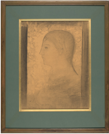
Fig. 4b Cat. 7 in a reconstructed matting and its original frame by Boyer