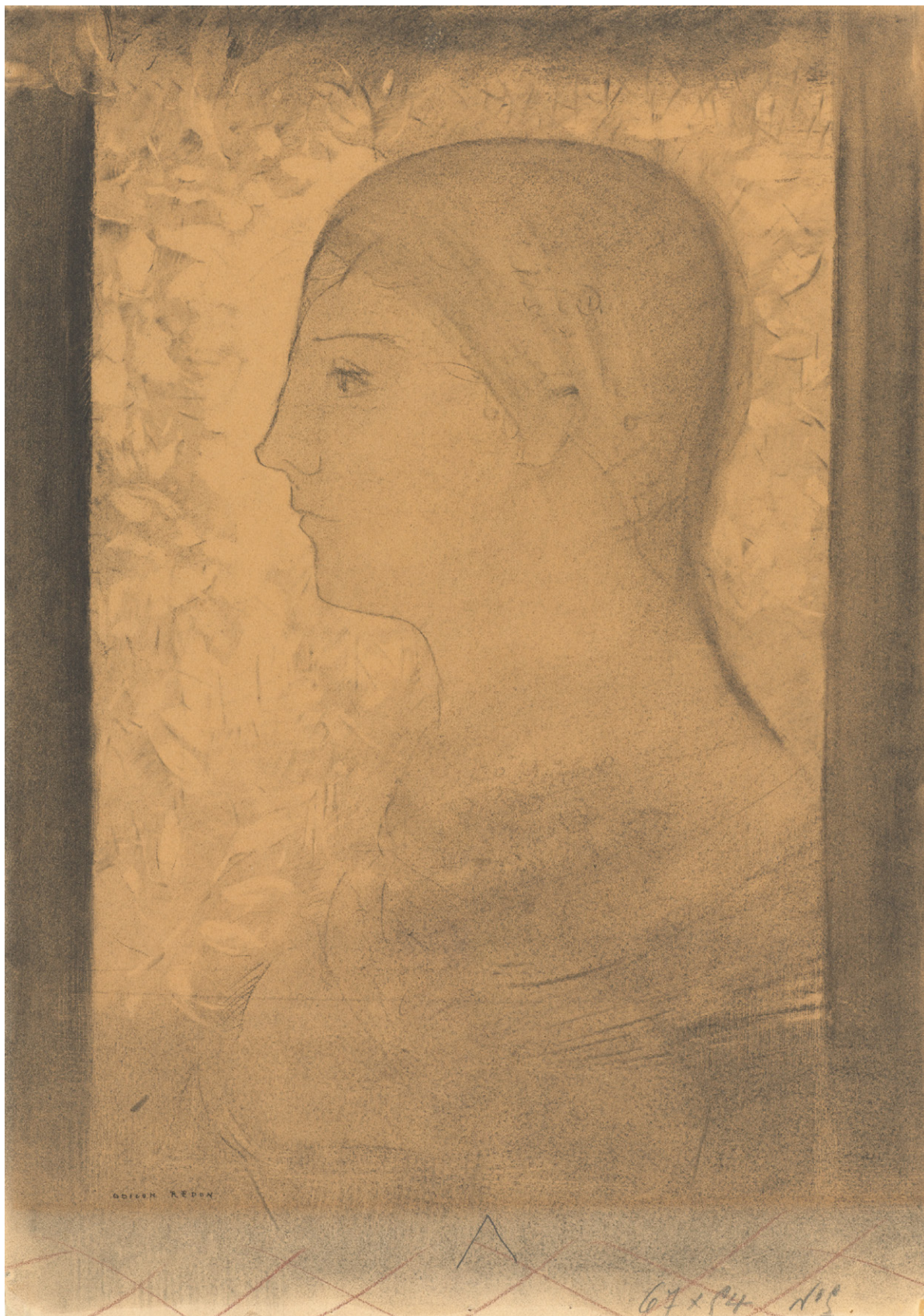
Cat. 7 Odilon Redon, Youth