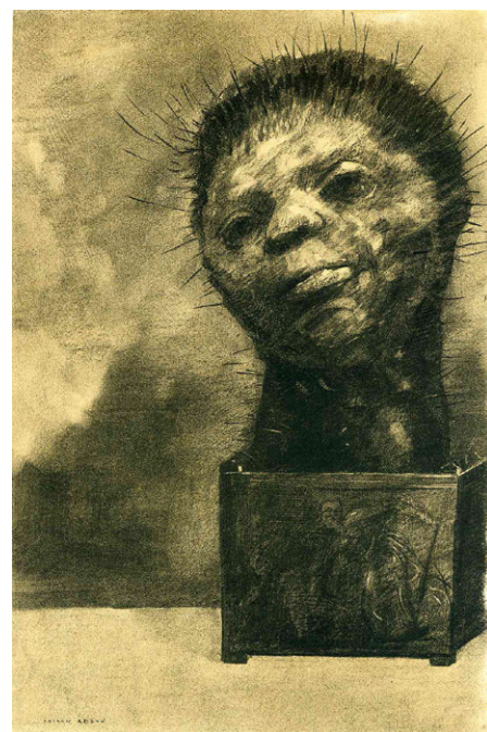
4a Odilon Redon, Cactus Man , 1882. Charcoal on paper, 46.5 × 31.5 cm. The Ian Woodner Family Collection

In Concern for the Absolute (cat. 8) Redon traded organic motifs for a geometric background. He heightened the geometry by tipping the sheet and radically cropping the composition, which was initially drawn on the sheet straight. 13 The artist had the drawing framed by his regular framer Boyer in a correspondingly angled mount: a remarkable invention that caused the work to leap out at the exhibitions in the Netherlands to which Bonger loaned it after acquiring the piece in 1901 (fig. 4c). Several critics made a point of commenting on the drawing in their