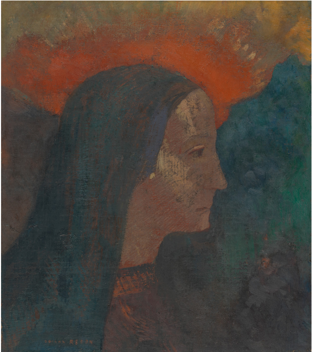
Cat. 11 Odilon Redon, Profile of a Pensive Woman