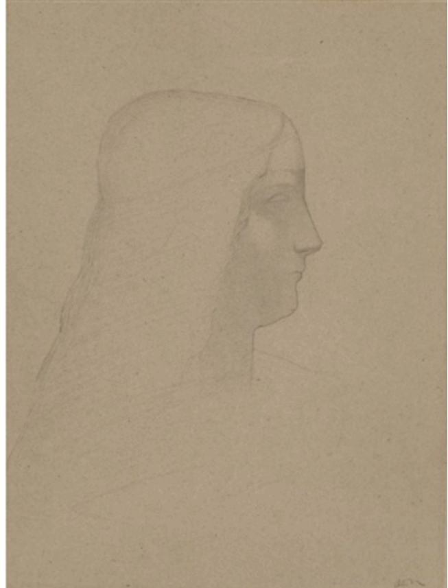
Fig. 4h Odilon Redon, Profile of a Woman (after Leonardo da Vinci) , date unknown. Black chalk on paper, 30 × 22.5 cm. Collection unknown