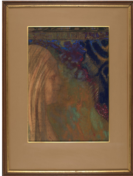
Fig. 4f Cat. 12 in its original matting and frame by Boyer

Bonger was immensely impressed anyway by Redon's female profiles. He acquired no fewer than ten of them over the years, seven in charcoal, two in pastels and one in oil paint. 19 The first two were purchased in 1894, at and shortly after the exhibition at Durand-Ruel in Paris. In a first letter, which marked the beginning of a long and deep correspondence, he introduced himself to the artist as the purchaser of Youth and Profile of a Woman against a Background of Black Poppies . 20 Redon also treated his profiles as a kind of litmus test for collectors: only after they had displayed sufficient appreciation and understanding of these works were they deemed worthy of acquiring the earlier noirs . But Bonger continued to buy profiles, even after becoming one of the most important collectors of Redon's work: he acquired the final one, Spring , in 1904. 21