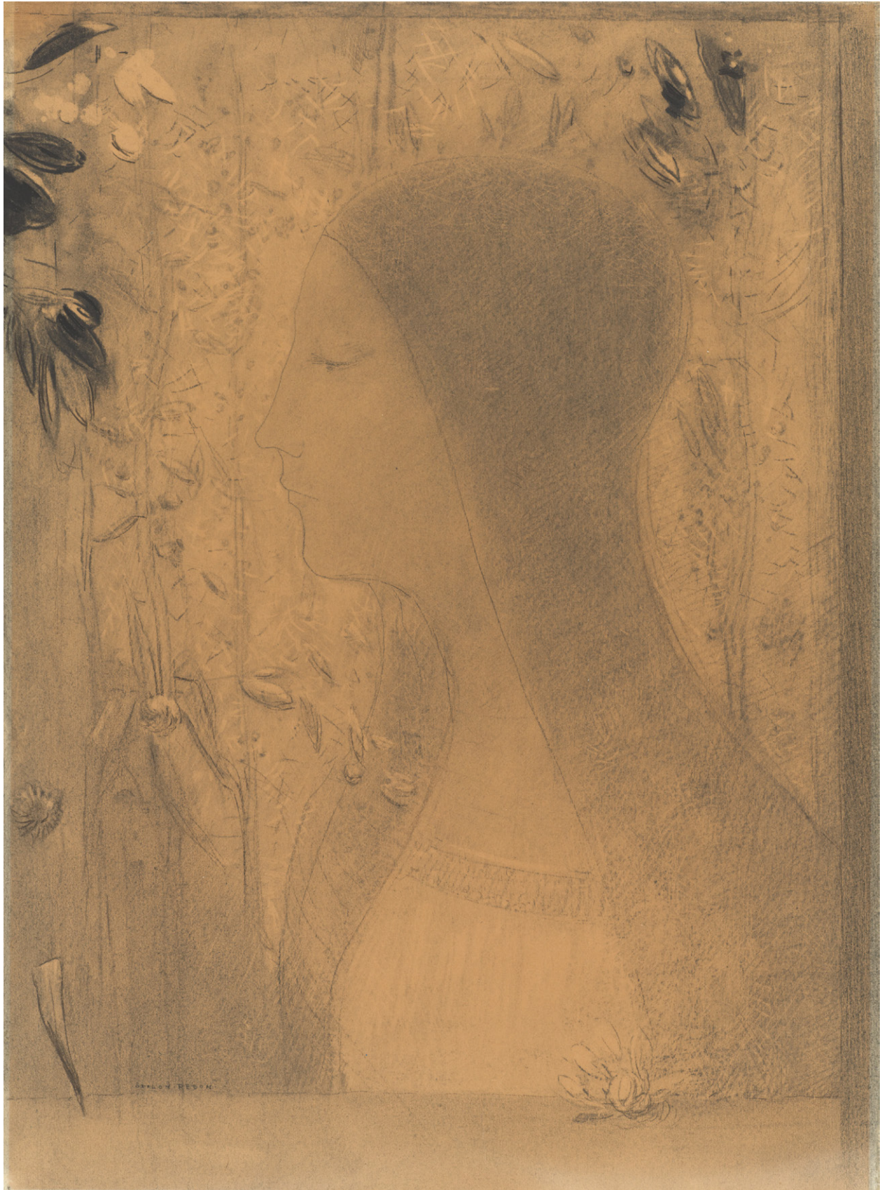
Cat. 10 Odilon Redon, Profile of a Woman against a Background of Black Poppies