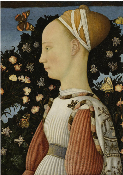
Fig. 4i Pisanello, Portrait of a Princess of the d'Este family , 1441–43. Oil on panel, 43 × 30 cm. Musée du Louvre, Paris