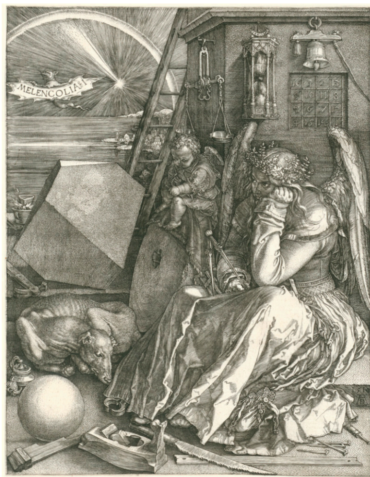
Fig. 4k Albrecht Dürer, Melencolia I , 1514. Engraving on paper, 23.9 × 18.5 cm. Rijksmuseum, Amsterdam