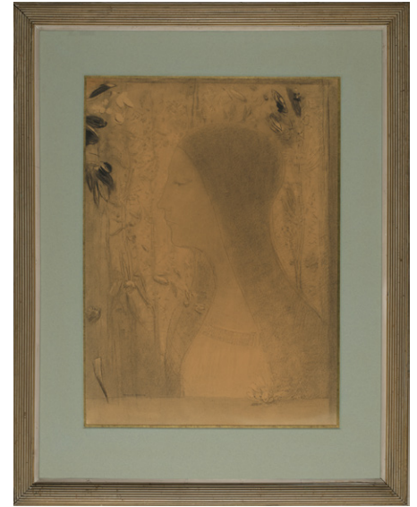
Fig. 4d Cat. 10 in a reconstructed matting and its original frame by Pierre Cluzel

14 Giovanni, 'De tentoonstelling van den Modernen Kunstkring', Algemeen Handelsblad (16 October 1911), p. 33: 'His charcoal Souci d'absolu is like the lithographs: we are very seldom able to explain them, yet they still suggest something to us. The same with this drawing, the tautness of which – the sharply profiled head between straight lines – fascinates us, even though it furnishes no clear answer to questions of meaning.' ('Zijn fusain Souci d'absolu is als die litho's: verklaren kunnen wij ze hoogst zelden, toch suggereeren ze ons iets. Zoo ook deze teekening, wier strakheid – die scherp geprofileerde kop tusschen rechte lijnen – ons boeit, ook al geeft ze op ons vragen naar den zin geen duidelijk antwoord.'). Frits Lapidoth, 'Odilon Redon', De nieuwe courant (28 May 1907), p. 15: 'I do not know what this means. It seems to have little effect on me. You sit down to look at it, let the composition spread its light over you as if from a dream [...] the dream world will open up to you. It is a pleasure, comparable to musical pleasure, which a composer must be able to inspire, that it must be possible to inspire through music. I experienced the same with most of the drawings. [...] One might see something entirely different, for instance, in the