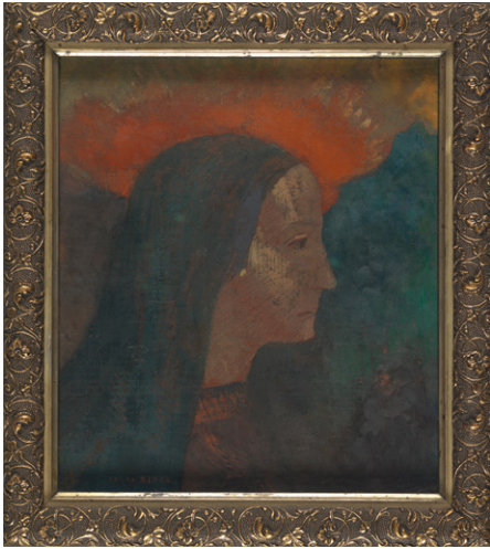
Fig. 4e Cat. 11 in its original frame by Boyer