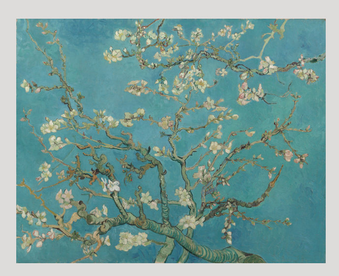
1. Vincent van Gogh, Almond Blossom, 1890, oil on canvas, 73.3 cm x 92.4 cm, Van Gogh Museum, Amsterdam (Vincent van Gogh Foundation)