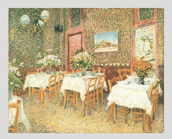
8. Vincent van Gogh, Interior of a Restaurant, 1887, oil on canvas, 45,5 cm x 56 cm, Kröller-Müller Museum, Otterlo

So numerous were their purchases that there was not enough space at the Kröllers' residence in Scheveningen to accommodate all the works of art. But Anton came up with a solution: in March 1912, before they had even set off for Paris, he purchased the building next door to his Müller & Co. offices at 3 Lange Voorhout in The Hague and part of the collection was transferred there. Helene turned the large rooms with their high walls into exhibition spaces. It was only possible at first for family, friends and business associates to admire the art collection, but as of the autumn of 1913, interested parties could make an appointment to view it on Mondays and Fridays between ten and four o'clock.<sup>52</sup>