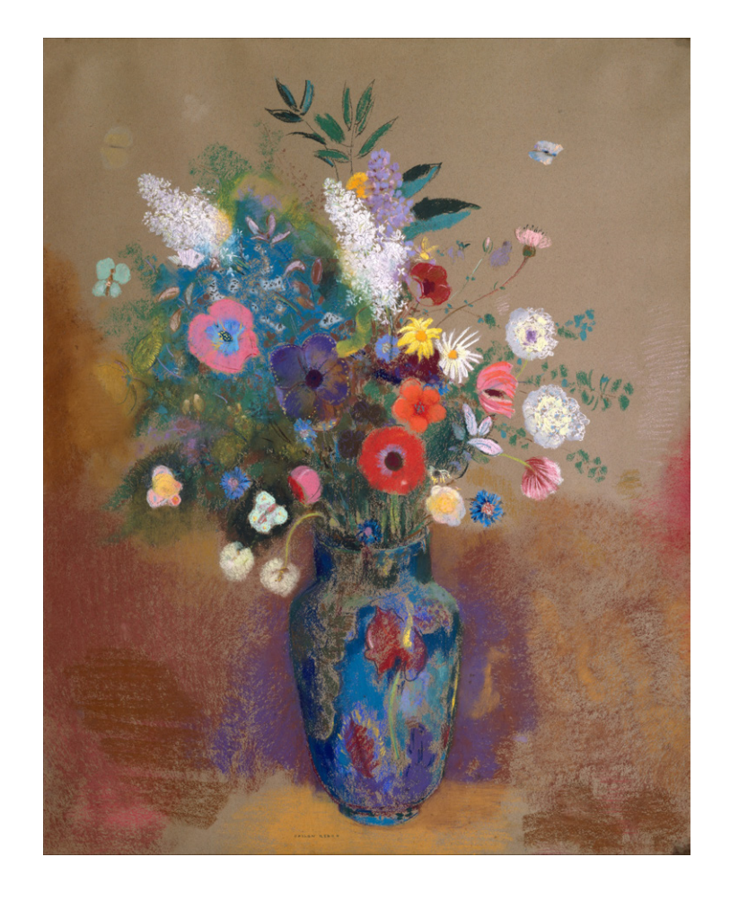
Fig. 11c Odilon Redon, Bouquet of Flowers, c. 1900–5. Pastel on paper, 80.3 × 64.1 cm. Metropolitan Museum of Art, New York, Gift of Mrs. George B. Post, 1956