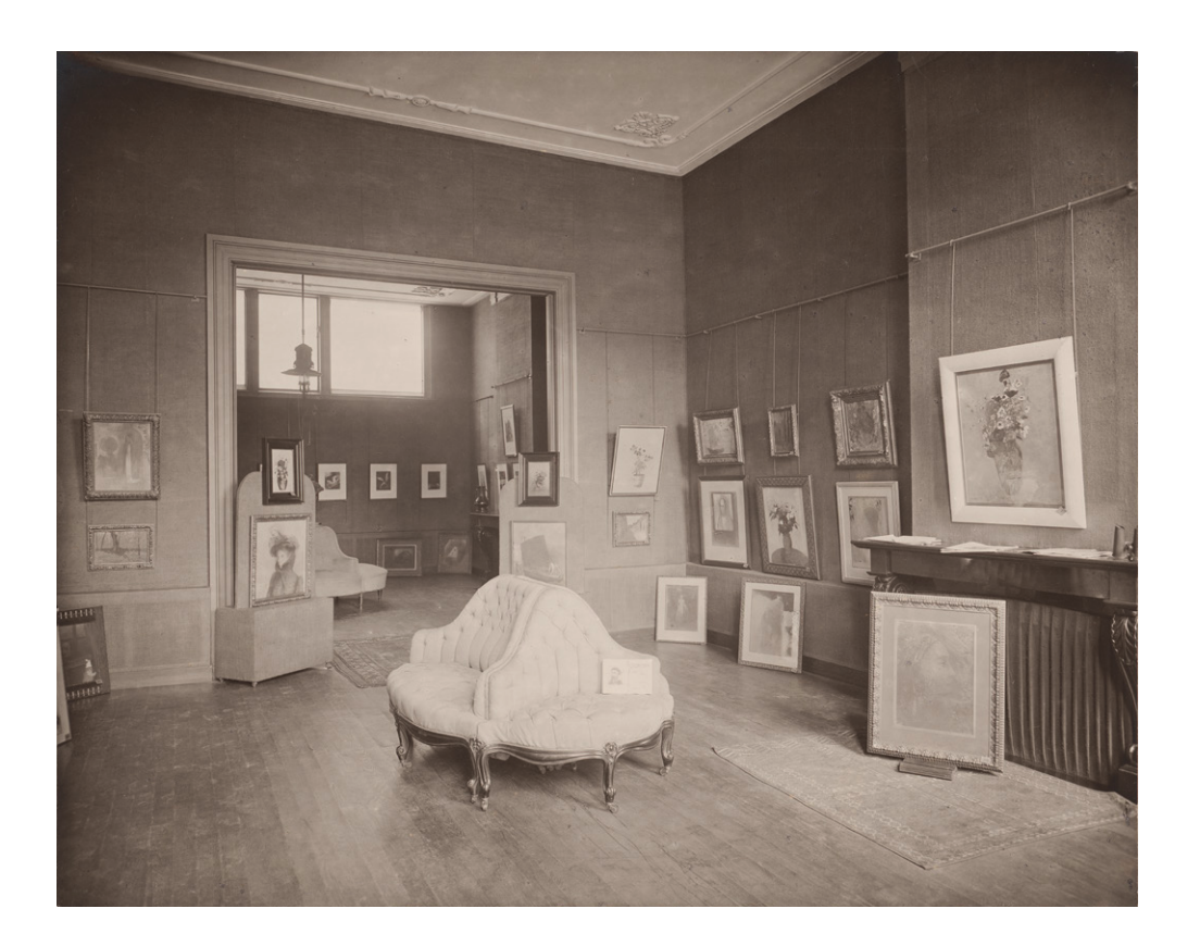
Fig. 11f Interior of Kunstzaal Reckers during the Redon exhibition of 1907, Rotterdam. Rijksmuseum, Amsterdam, Andries Bonger Archive, S. Crommelin Bequest

he had originally hung Vision by the window (fig. 11e), after moving to Vossiusstraat 22 in 1906 he gave it pride of place in the centre of a wall, with Redon's other paintings and pastels grouped around it. He wrote to the artist: 'The walls are now fully accoutred and look well. The long side, above the new low bookcase, is occupied by a whole series of your pastels, with the vision of flowers at the centre: the effect is splendid.'<sup>15</sup>