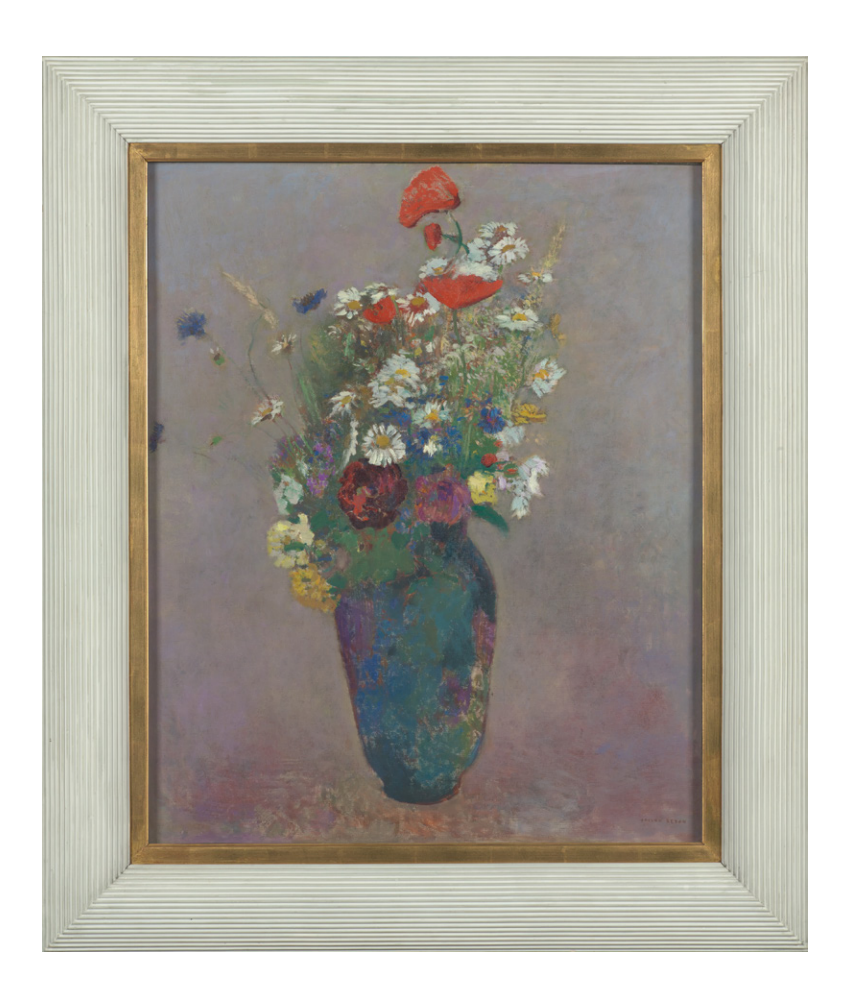
Fig. 11d Vision. Vase of Flowers in its original frame by Boyer

Andries Bonger bought this magnificent flower still life from the artist in 1901 as part of a group consisting of both older and more recent works that, taken altogether, represented 'a complete range' of Redon's art.<sup>7</sup> As usual, Redon had had this painting framed by his regular frame-maker, Boyer, who produced a frame of exceptional quality. It is a so-called Degas frame of white pine, handmade with a profile of reeded wood, called a cadre baguette , and gold inlay (fig. 11d).<sup>8</sup> Redon's choice of a more expensive, handcrafted frame instead of the industrially produced frames he generally used underlines the importance of this work to him.<sup>9</sup> Bonger was jubilant when he received it: 'The big bouquet of flowers in the white frame is wonderful, a sumptuous piece, of the greatest beauty.'<sup>10</sup> Redon replied that 'the definitive effect' of the work was indeed determined by the frame.<sup>11</sup> Both artist and collector were so happy with the frame that they had an identical one made for the other first-rate flower painting of the same format, which Bonger had purchased from Redon the year before.<sup>12</sup> The paintings hung as pendants in Bonger's home.<sup>13</sup>