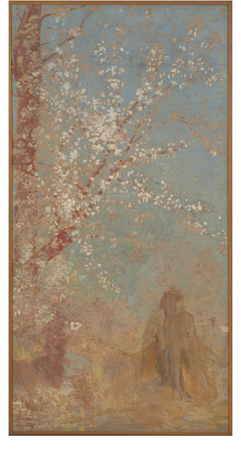
Fig. 14b Cat. 35 in its original frame by Boyer

The Nabis inspired their older artist friend to broaden his oeuvre as peintre-décorateur . Redon and the artists of this group – the latest avant-garde – portrayed and influenced one another.<sup>5</sup> Probably at Redon's urging, Bonger went to visit the patron Alexandre Natanson (1867–1936) in order to see Edouard Vuillard's (1868–1940) series of nine decorative panels, Jardins publics (1894), installed in his home. Bonger was deeply impressed: 'They are ravishing, incomparably charming. What a joy to have those landscapes constantly before one's eyes', he wrote to Redon (fig. 14c).<sup>6</sup>