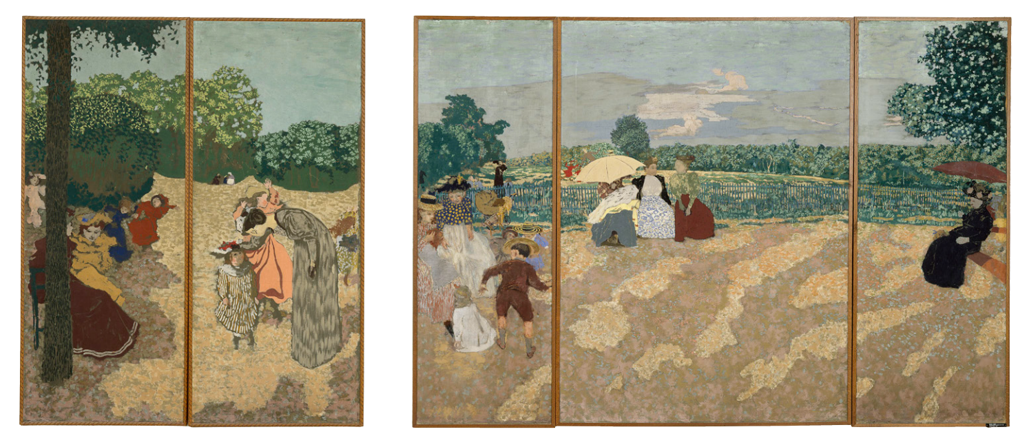
Fig. 14c Edouard Vuillard, Jardins publics, 1894. Five of nine decorative panels, distemper (peinture à la colle) on canvas, together approx. 214 × 480 cm. Musée d'Orsay, Paris