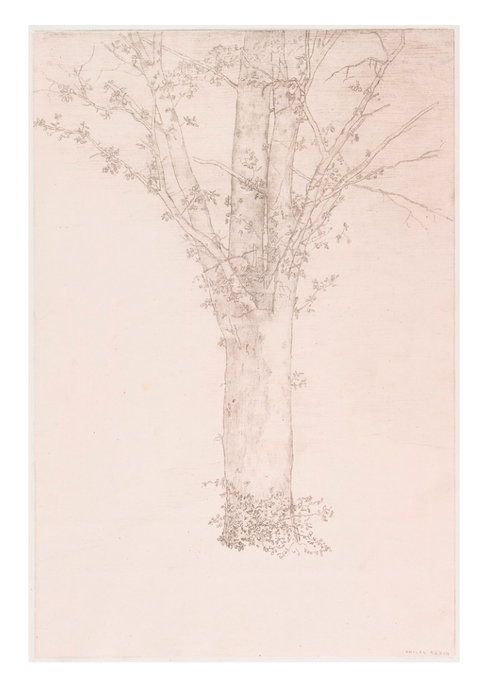
Fig. 14g Odilon Redon, Tree , 1892. Lithograph in black on China paper on wove paper, 40.4 × 32.1 cm. Museum of Modern Art, New York, Gift of Abby Aldrich Rockefeller

legend of Buddha in the Revue des deux mondes. <sup>25</sup> He sketched the birth of the holy Buddha, meditating under a tree against the backdrop of a fairy-tale India, full of misty rainforests, screeching peacocks and 'veiled beauties'. Buddha withdraws in isolation and ascesis to sit under a tree, sinking into the depths of his being in order to fathom the highest truth of human existence. Indeed, this is how Buddha appears on Redon's panels. Schuré writes: 'Because his ascetic glance – gentle and piercing, subtle and profound, like his doctrine – is [the glance of] one of those who confront us with the greatest insistence with the biggest question of the hereafter: To be or not to be! <sup>'26</sup>