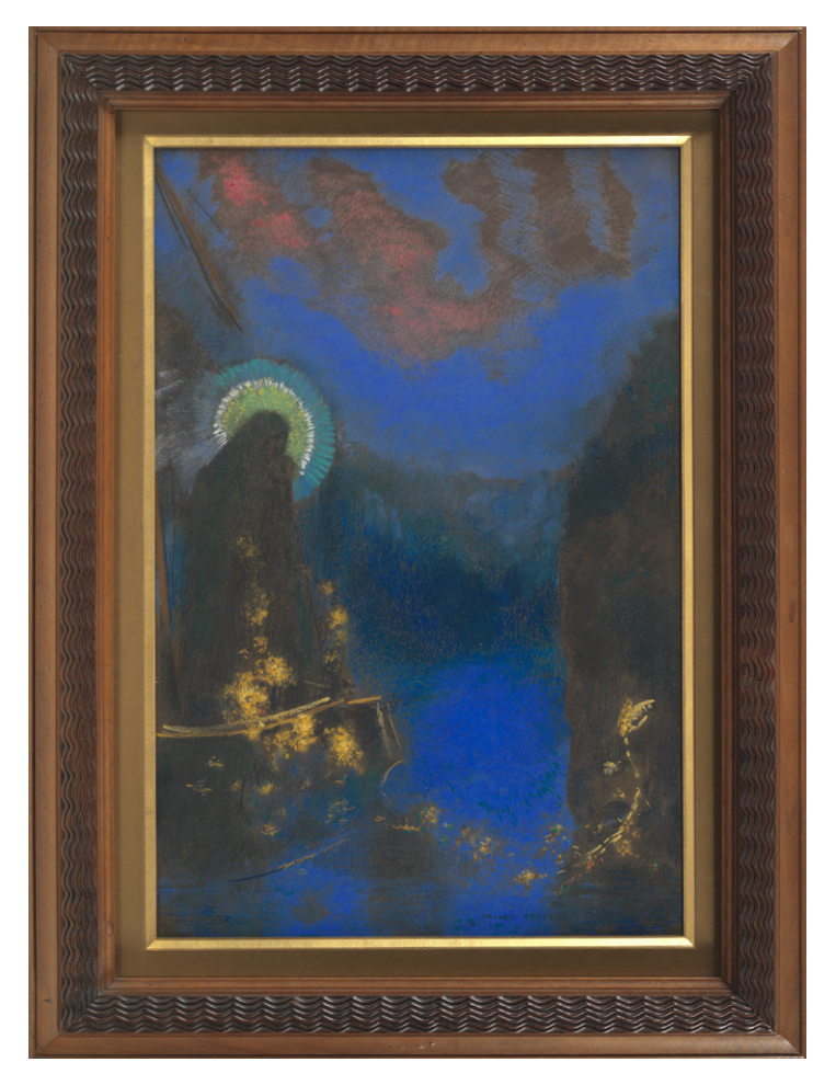
Fig. 8d Cat. 20 in its original frame by Dosbourg or Boyer

22 Letter 91 (31 December 1902), Amsterdam. The