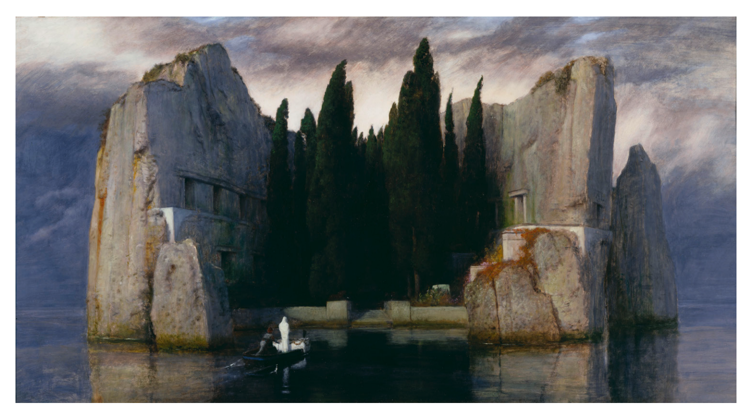
Fig. 8a Arnold Böcklin, Isle of the Dead, 1883. Oil on panel, 80 × 150 cm. Alte Nationalgalerie, Berlin

9 Wildenstein Lacau St Guily and Decroocq 1992–98, vol. 3 (1996), p. 326 and nos. 1931–59: 'Mais dans ce thème marin, thème essentiel de l'oeuvre de Redon, les silhouettes ne sont le plus souvent que le prétexte à un subtil jeu de la lumière et de la couleur. Seule compte la poésie mélancholique et lumineuse qui accompagne le voyage initiatique du timonier'. 10 Odilon Redon, Le livre de raison d'Odilon Redon: premier cahier , Ms 42 821, 1898, no. 324: 'Ciel sombre brun avec nuages violet et rouge, à gauche un être auréolé sur une barque. Des gerbes d'or à la proue de la barque, et sur les eaux une sorte de fosforescence bleue, comme un feu-follet'.