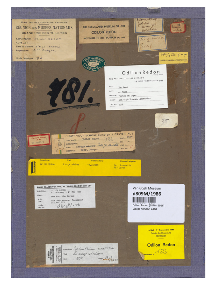
Fig. 8e Reverse of cat. 20 with a label by Dosbourg

question, however, is whether the frame had actually