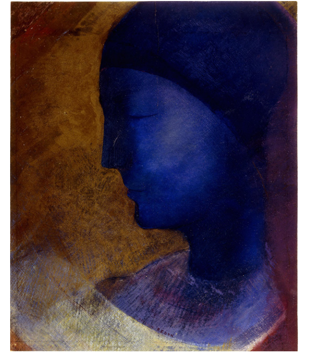
Fig. 8b Odilon Redon, The Golden Cell, 1892. Oil and coloured chalk with gold on paper, 30.1 \times 24.7 cm. British Museum, London , Campbell Dodgson Bequest

(Kunsthal Rotterdam), 2016, p. 82. 20 The Hague, Haagsche Kunstkring, Odilon Redon, 20 May–1 July 1894. 21 Letter 81, op. cit., note 17.