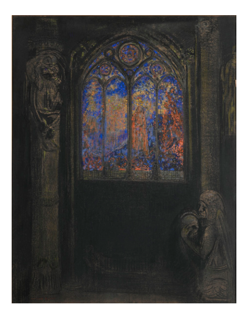
Fig. 13a Odilon Redon, Temple. Stained-glass Window , 1904. Charcoal and pastel on cardboard, 87 × 68 cm. Musée d'Orsay, Paris

13 See entry 14, 'Decorative Paintings', cat. 35: The Red Tree (https://www.vangoghmuseum.nl/en/ collection/s0465N1996).