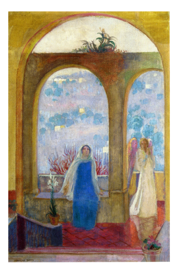
Fig. 13b Maurice Denis, Annunciation under the Arch with Lilies, 1913. Oil on canvas, 74.6 × 48.2 cm. Private collection

16 See the 'Secret of Redon' in the introductory essay of this publication.