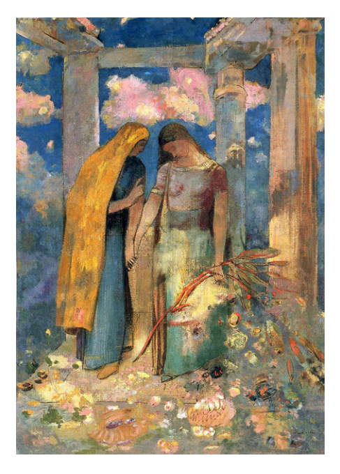
Fig. 13c Odilon Redon, Mystical Conversation , c. 1896. Oil on canvas, 65 × 46 cm. The Museum of Fine Arts, Gifu

In these two paintings by Redon, as in a dream, elements and scenes that are incompatible in reality glide subtly into one another, without disrupting the overarching atmosphere. They invite the viewer to lose themself in their own purely personal musings and dreams.